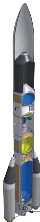
Vulcain® 2 engine

The qualification tests campaign took place from 2017 to mid-2019 on the P5 tests stand at the DLR facility in lampoldshausen (Germany) and the PF50 tests stand at ArianeGroup's site at Vernon France : The Vulcain 2.1 engine ran for 13,798 seconds, (nearly four hours).